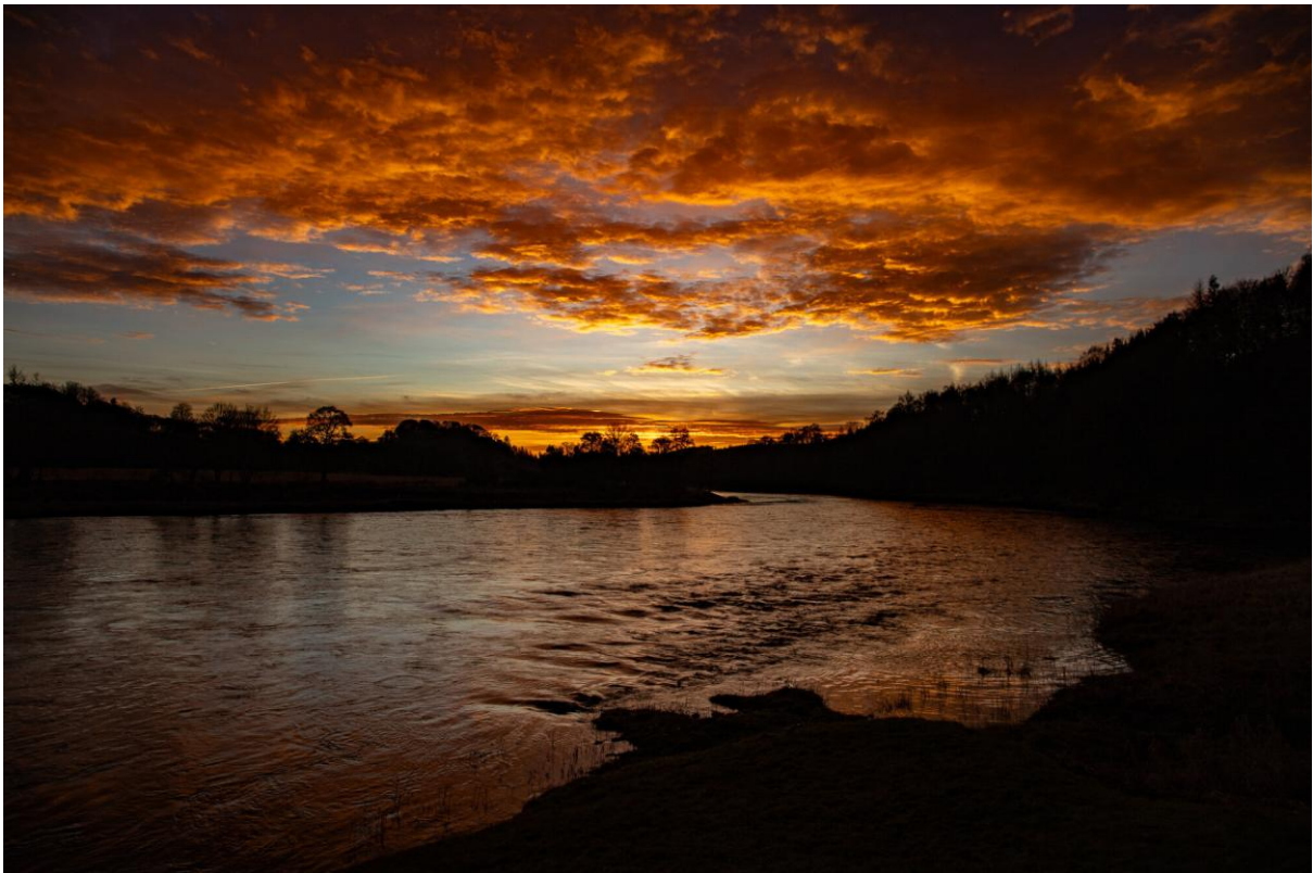
Dawn over Newtyle